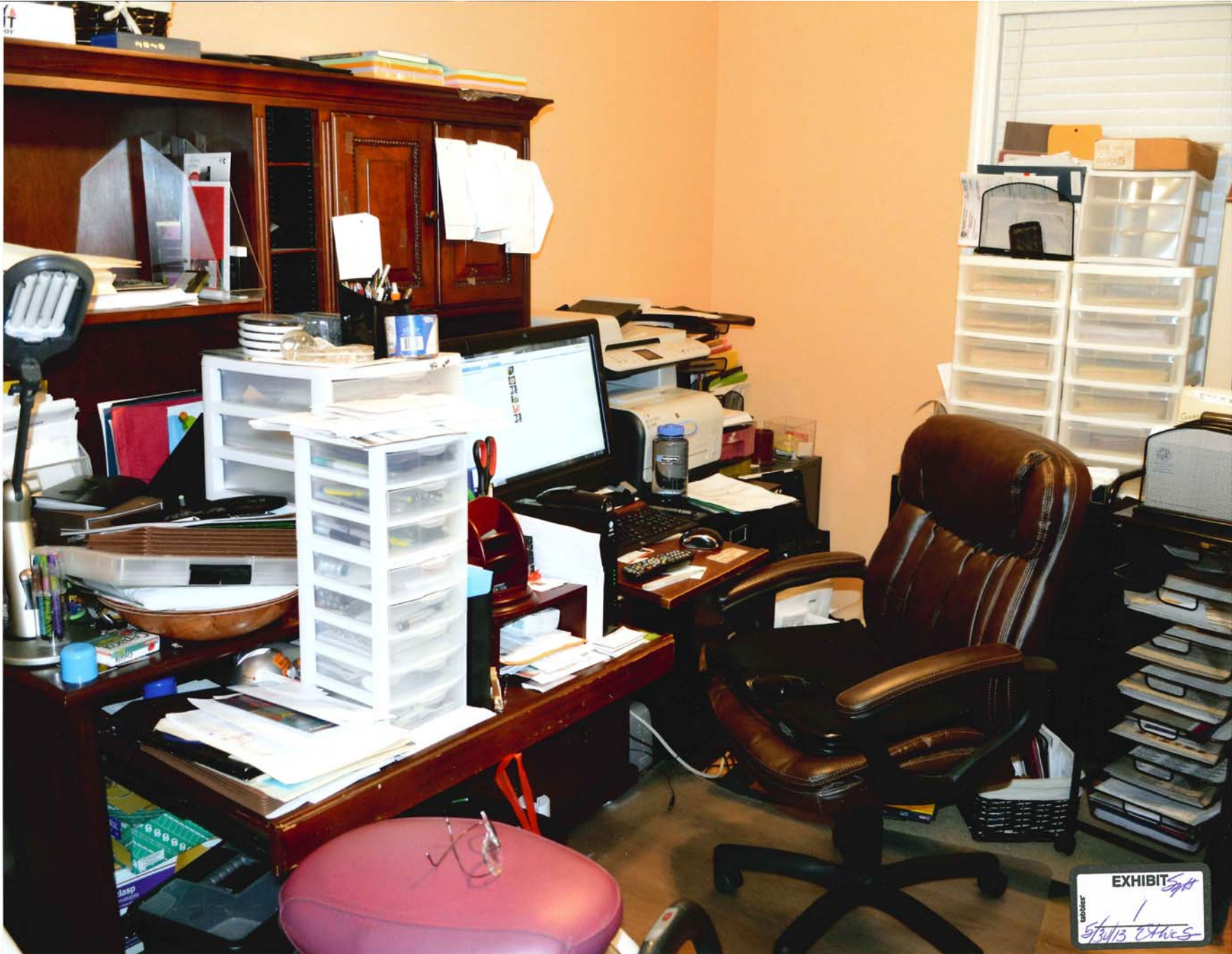
EXHIBIT Sgt 1 5/31/13 Chis