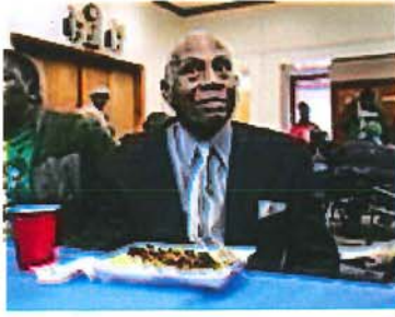
Thanksgiving Turkey Giveaway